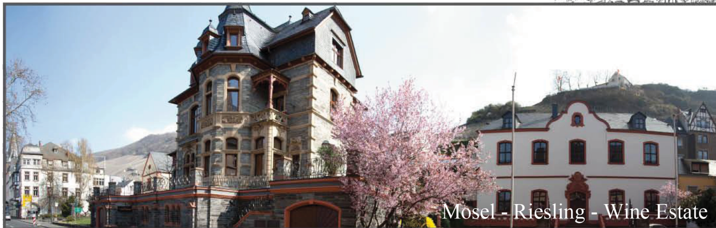
Mosel - Riesling - Wine Estate